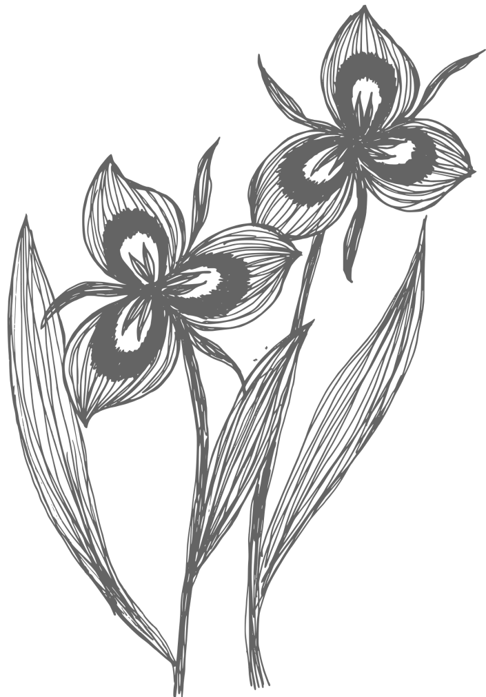
DAY 71 - MORAEA