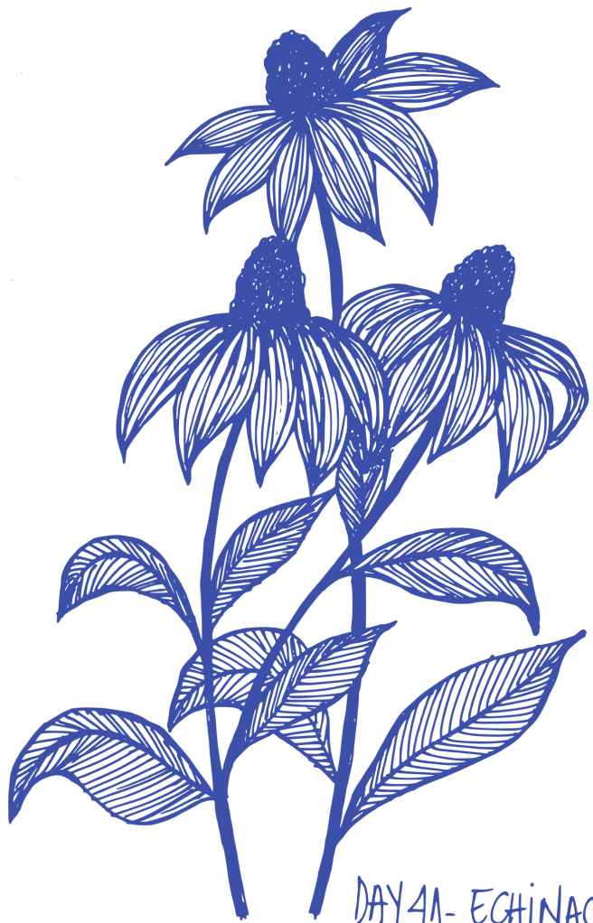
DAY 41 - ECHINACEA