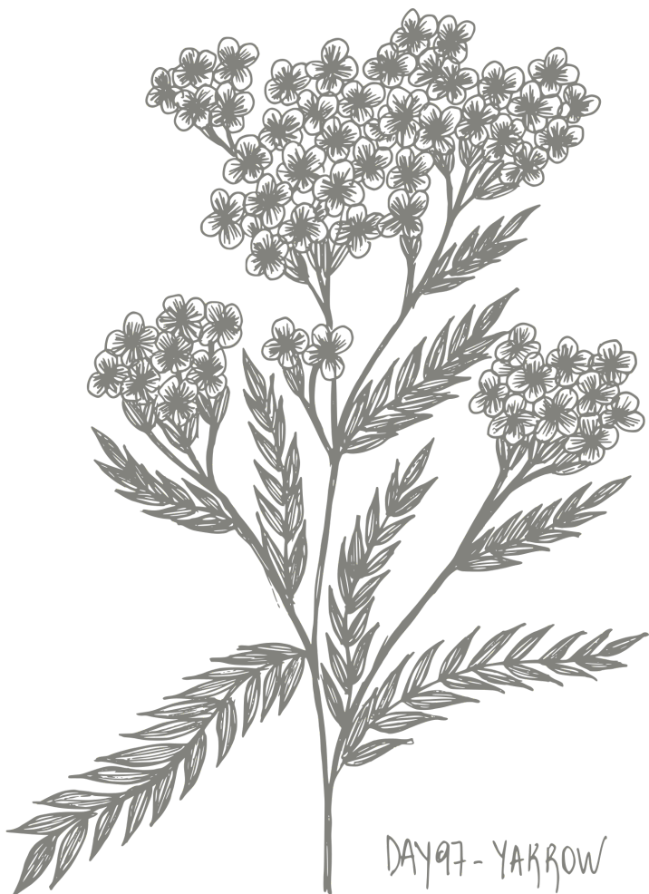
DAY 97 - YARROW