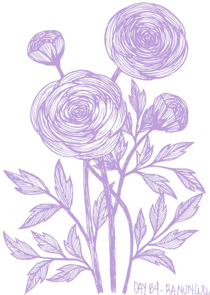
DAY 84 - RANUNCULUS