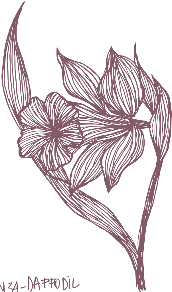
DAY 31 - DAFFODIL