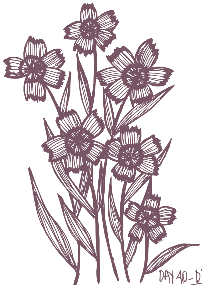
DAY 40 - DIANTHUS